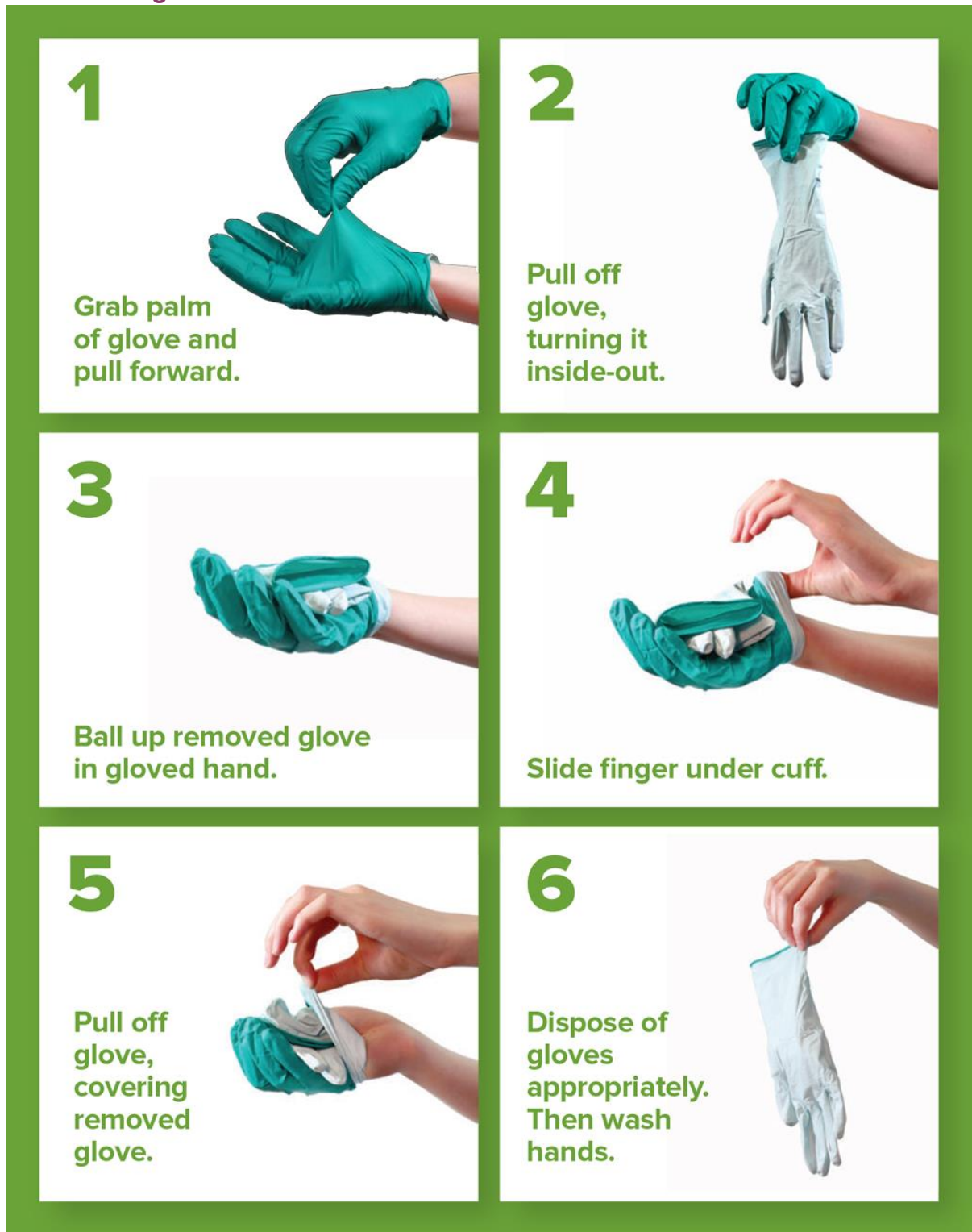
Figure 5 Removing disposable gloves

Dispose of the gloves by placing them inside out in the biohazard bin or in a sealed plastic bag until placed in a biohazard container.